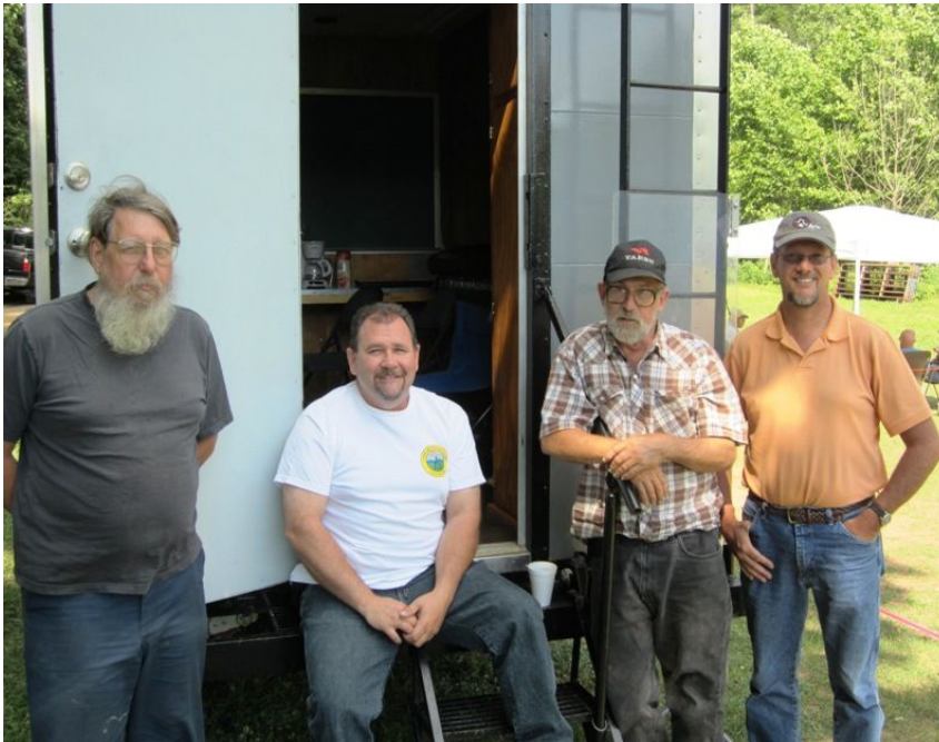
Four Hams outside the Communications Trailer