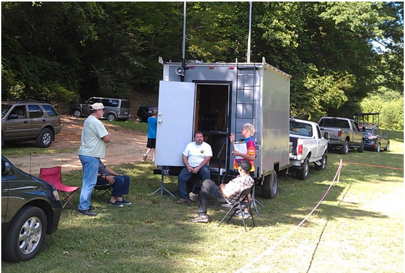
A Briefing at Net Control